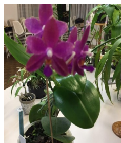
Phalaenopsis Phal. Chienlung Red King Webb G