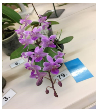
Species Monopodal Phal lindenii Arrowsmith P