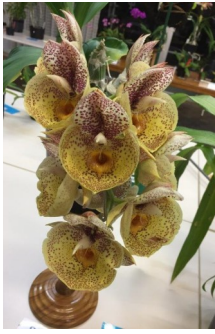
Cynoches Golden Showers x barthierum Vickers L & H