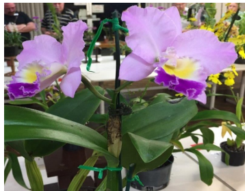
Cattleya Exhibition up to 90mm C. Dal's Choice 'Sharon' Haase K