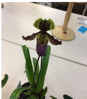
Species Sympodial Paph henryanum 'Pat' x 'Ching Hua' Ferguson M