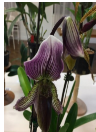
Paphiopedilum Other Paph. fairicanum x Laser' Hsinying Flame' Tierney M