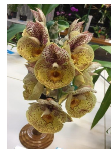
Any Other Genera Cynoches Golden Showers x barthierum Vickers L & H