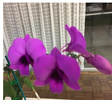
Australian Native Species Den bigibbum Haase K