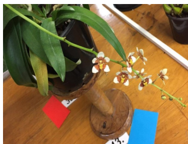
Australian Native Hybrid Sarco. Hargitay x hartmannii Tierney M