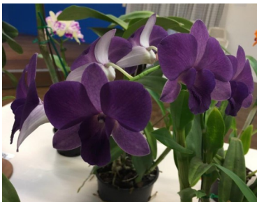
Dendrobium Den Blue Planet 'Globe' Haase K