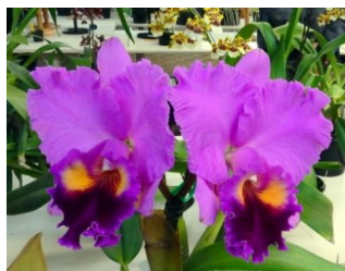
CATTLEYA OVER 90mm Plant C. Redland Standard Grower :- K.. Haase