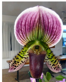
Paphiopedilum Other Plant:- Paph. Flame Arrow 'T-Star' Grower:- L & H Vickers