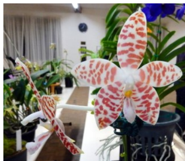
Plant :- Phal. amboinensis Grower :- G. Grant