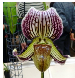
Species SYMPODIAL Plant Paph. fairreanum Grower :- K Haase