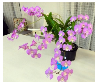
Australian Native HYBRID Plant :- Den Fantaryland 'Princess' Grower :- K Haase