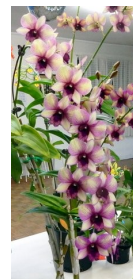
DENDROBIUM Plant:- Den Napporn Green Star 'Delilah' Grower :- G Grant