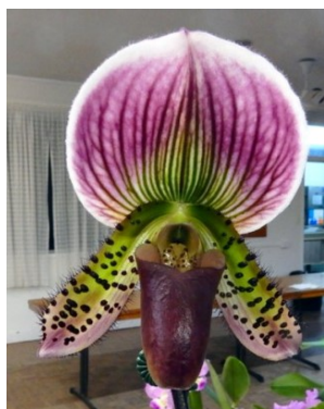
Plant :- Paph. Flame Arrow 'T-Star' Grower :- L&H Vickers