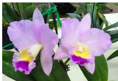
Cattleya Exhibition up to 90mm Plant :- C. Dal's Choice Grower:- Haase K