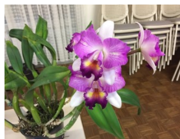
Novice Plant:- Rth. Topaz Love Grower :- O'Reilly A