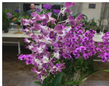
Dendrobium Plant :- Topaz Rose 'Topaz' Grower :- Mc Ginn K & A