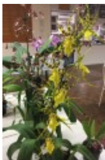
Plant :- Phal Tomo Arenus x Tiarnony Glory Grower :- Grant G