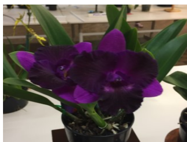
Cattleya Exhibition up to 90mm Plant :- Gct. Distant Drum 'Dark Horse' Grower:- Callaghan T & P