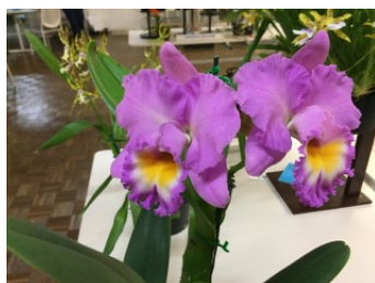
Cattleya Exhibition Over 90mm Plant :- Rlc. Caricia en Paraiso Grower :- Haase K