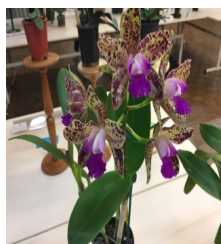
Cattleya Non Exhibition Plant:- C Deception Spots x Cloud's Candy Corn Grower:- Callaghan T & P