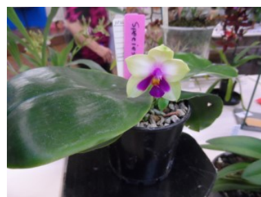
Species Monopodal Plant :- Phal belina 'Honey' Grower :- Grant G