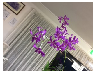
Australian Native Hybrid Plant :- Den Superbens Grower :- Kidd I R