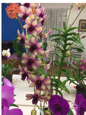
Plant :- Den . Nopporn Green Star ' Delilah' Grower :- G Grant