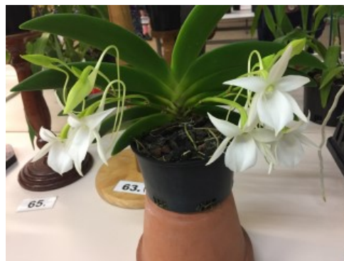
Plant :- Angraecum leonis Grower :- P. Arrowsmith